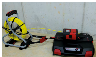
RM35 with belt and clip system connected to GF4.5 fiberglass rod