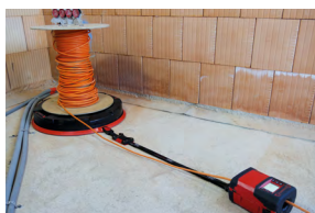
RM35 with belt and clip system connected to XB 500